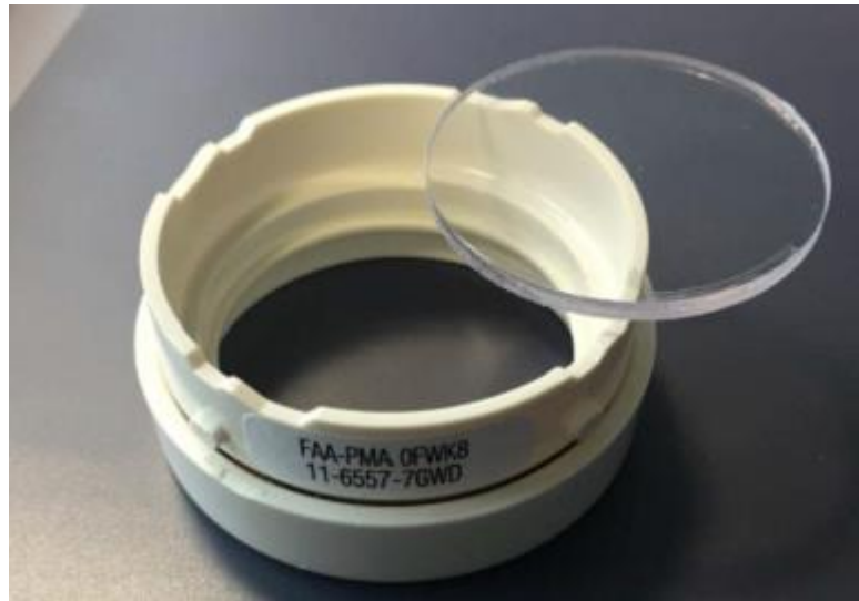
Figure 1. Defective Part from Customer – Lens Separated During Installation

The subject parts are installed in the Bezel Assembly of the PSU installed on various Boeing aircraft.